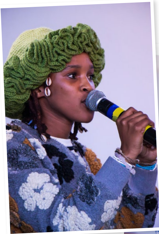
Below: Voices from the frontline of activism and civic engagement

They look to transcend professionalisation and bureaucratization, philanthropy and welfare gestures, discourse theatre, and formal technocracy, in favour of substantive equality, justice, and freedom.